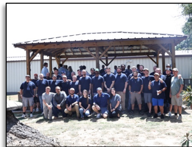
FIGURE 3 ARM180 HELD THE GRAND OPENING FOR THEIR ARORP-FUNDED HOUSING EXPANSION, WHICH PROVIDED 14 ADDITIONAL BEDS FOR MEN IN ARKANSAS COUNTY.