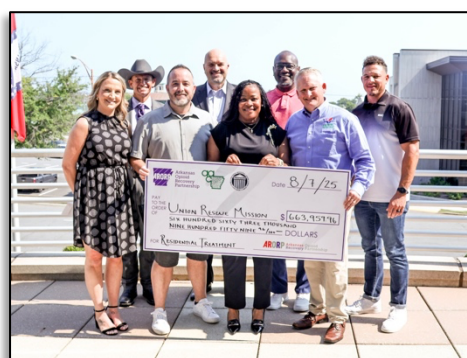
FIGURE 2 UNION RESCUE MISSION ACCEPTS FUNDING TO CREATE AN INPATIENT TREATMENT CENTER IN LITTLE ROCK, ARKANSAS.