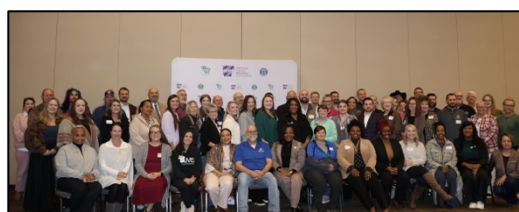
FIGURE 1 ARORP PARTNERS AT THE 2024 PARTNER'S MEETING.

proposals and make recommendations to the AAC Director, the AML Director, and the Partnership Director and Deputy Director regarding programs and strategies to abate the Arkansas opioid epidemic in a manner consistent with approved purposes, any settlement agreements, and any orders approving settlements. Board members were intentionally selected to represent people with lived experience and a diversity of geographic regions, economic sectors, and demographics. The ARORP board provides leadership, addresses important issues, and makes funding recommendations.