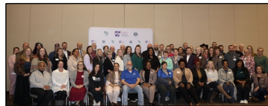
FIGURE 1 ARORP PARTNERS AT THE 2024 PARTNER'S MEETING.

proposals and make recommendations to the AAC Director, the AML Director, and the ARORP Director and Deputy Director regarding programs and strategies to abate the Arkansas opioid epidemic in a manner consistent with approved purposes, any settlement agreements, and any orders approving settlements. Board members were intentionally selected to represent people with lived experience and a diversity of geographic regions, economic sectors, and demographics. The ARORP board provides leadership, addresses important issues, and makes funding recommendations.