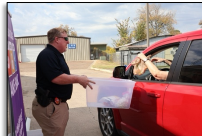
FIGURE 3 A LAW ENFORCEMENT OFFICER HELPS DISPOSE OF UNWANTED MEDICATIONS AT THE FALL 2024 ARKANSAS DRUG TAKE BACK DAY.